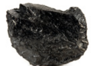
Anthracite (hard coal)

Most mature coal, with highest carbon content of any type of coal, used primarily for residential and commercial space heating