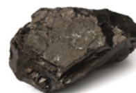
Sub-bituminous coal (soft coal)

Lowest rank of coal used almost exclusively as fuel for electric power generation