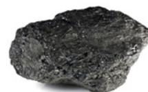
Lignite (brown coal)

Lowest rank of coal used almost exclusively as fuel for electric power generation